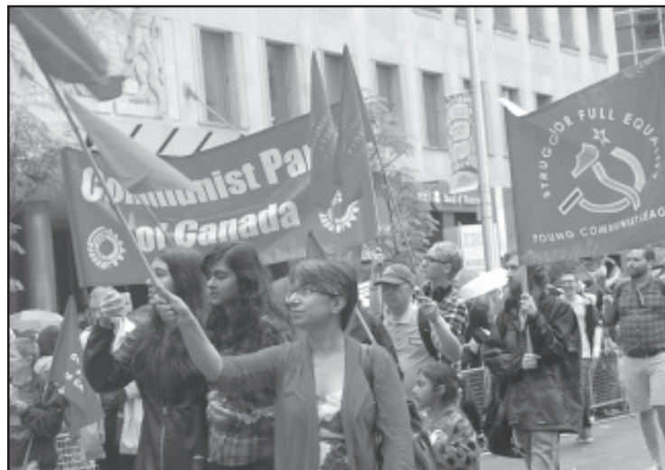
Above, the Communist Party/YCL contingent at this year's TorontoPride Parade, and below left, the contingent from City Hall.

issue; trans* people are 10% of the LGBTIQ population, and face huge medical costs, higher unemployment, less access to housing, widespread intimidation at work, and lack of legal protections. Yet right-wing forces continue to scapegoat the LGBTIQ community along with racialized groups and other minorities.