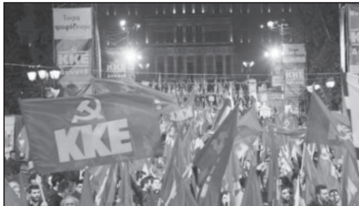
KKE banners at a rally in Syntagma Square outside the Greek Parliament in Athens

The GS of the CC of the KKE, in reference of the government's dilemma, "anti-people agreement, i.e. memorandum, or Grexit,"