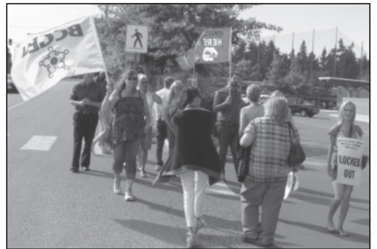
On the Nanaimo Golf Club picket line.

The locked out union workers continue their courageous vigil, united in the knowledge of community support, defiant and determined to win. ●