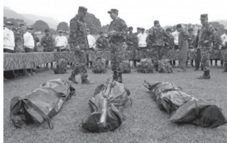
Colombian police officers and soldiers stand by the bodies of alleged "rebels killed in combat."