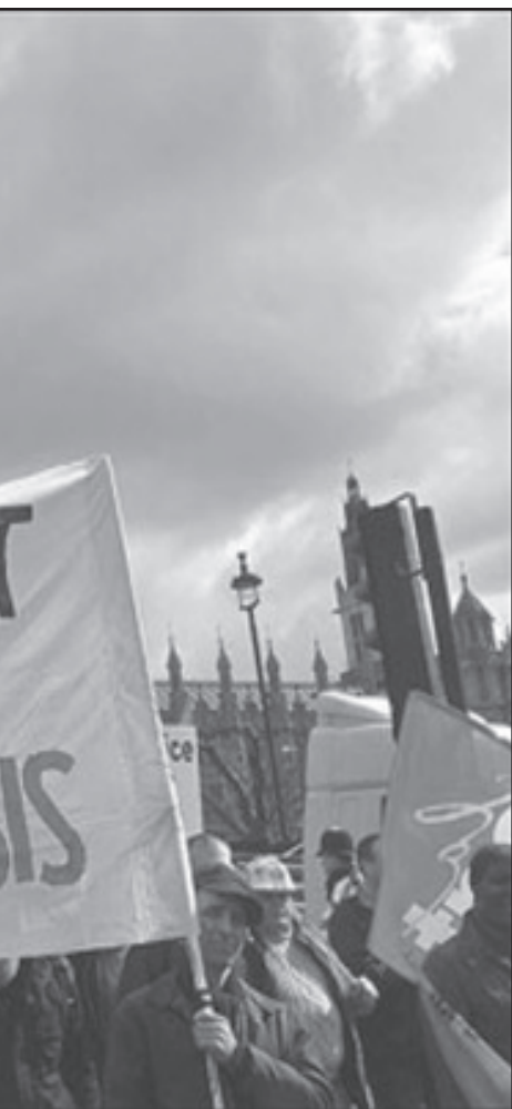
Europe against corporate... g these actions in London Portugal (below)