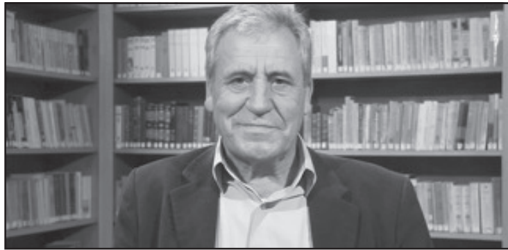
Portuguese Communist leader Jerónimo de Sousa

these austerity measures, the ruling class’s hypocrisy was outlined. Austerity’s imposition on the Portuguese people was supposedly to impede the country’s bankruptcy. The aggression pact worsened the situation: the debt is much higher than before and the country is more dependent on foreign countries than ever. Since 2008, 160 billion Euros have been allocated for interest payments on the debt alone. The numerous bailout plans for financial institutions, such as banks, have to be added to this sum.