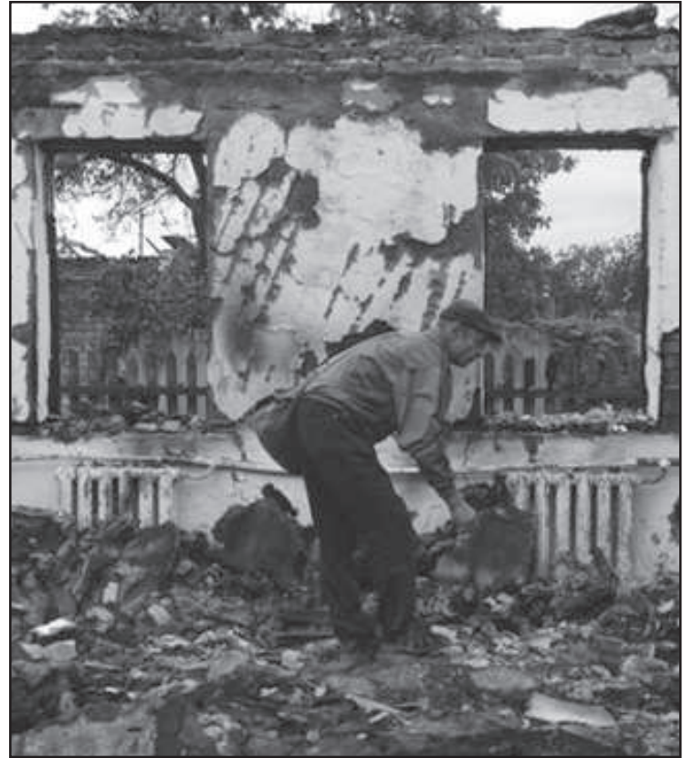
Home in the eastern city of Sloviansk destroyed in a June 24 bombing raid by Ukraine military forces.

Ukraine deserves the right to determine its destiny free from political domination from either east or west, and to reject either the economic control of Russia's corrupt oligarchs or the devastation of IMF imposed theft and austerity. Its diverse regions deserve fair representation within a decentralized federal system, but most of all, Ukraine deserves peace, dialogue and reconciliation, and the rejection of the fascist nationalism that has