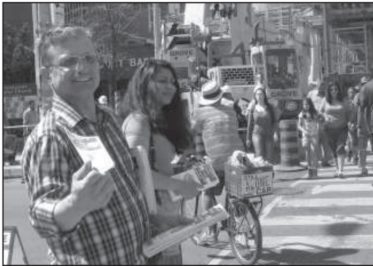
Communists on the streets, distributing the party's leaflets at Toronto's Dufferin and Bloor during the Ontario election campaign.

Rent controls and plant closure legislation with teeth are also high on the agenda to stop greedy landlords and run-away corporations, along with action and funds to protect healthcare from privatization in all its evolving forms. Anti-scab legislation and