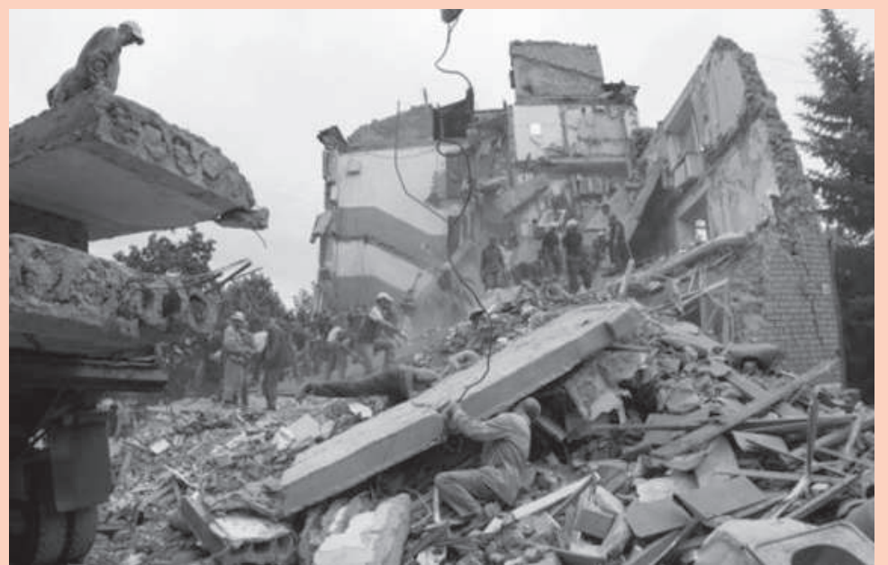
After a ten-day ceasefire in late June, the Ukrainian military resumed the bombardment of populated centers in the eastern provinces of Donetsk and Lugansk, both bordering with neighboring Russia. Above right, forces of the NATO-backed government in Kiev conducted a July 15 air strike which killed 11 people in this apartment block in Snizhne, 100 km. east of Donetsk. Two days later, Malaysian Air flight MH17 crashed in the region under mysterious circumstances.