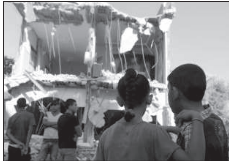
Two children in front of a house destroyed in an Israeli air strike in Maghazi refugee camp in Gaza.