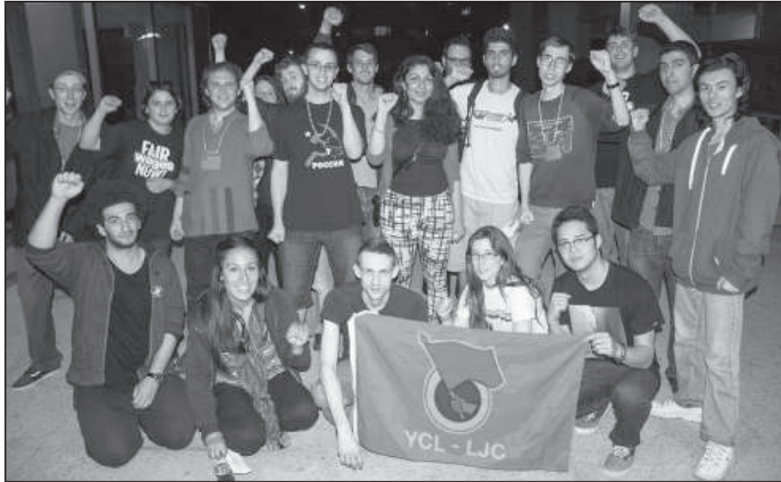
Some of the participants at the YCL-LJC 26th Central Convention

Delegates discussed the capitalist economic crisis, imperialist intervention and war globally, environmental crisis and climate change, the intensification of the attack on organized labour, youth unemployment/under-employment and precarious work, poverty wages, ableism, xeno-