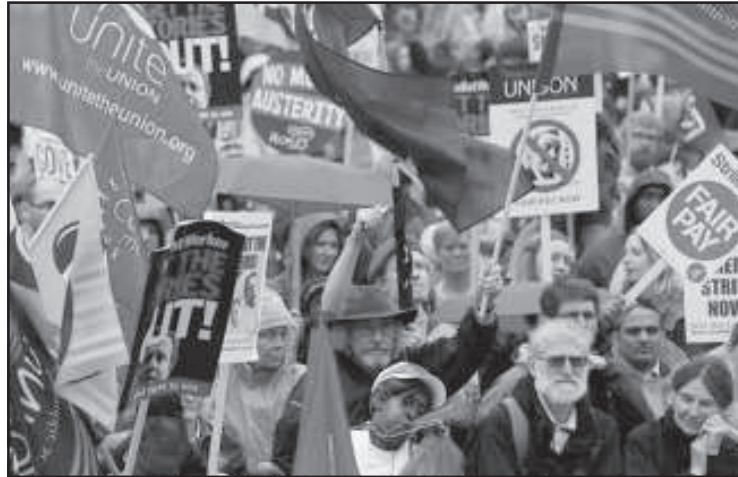
The scene in London's Trafalgar Square as two million British workers strike against Tory policies on July 10.

The civil servants' union leader called for an urgent meeting of trade unions to "ensure that further action is planned and co-ordinated