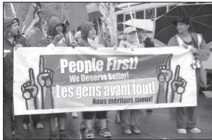
Protesters at the G20 in Toronto last June

Electing MPs who will deliver an agenda for people (not for profits), and an agenda for cities, will be a big step forward. Such an agenda should include building new affordable public and social housing stock, and amassing public lands and assets instead of selling them off. It means expanding public transit and building a publicly-owned Canadian transportation industry. It requires a new financial deal for