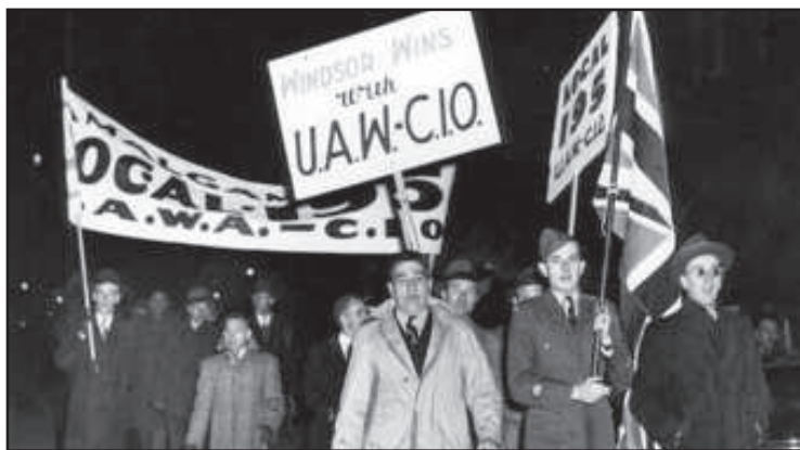
On the picket line during the 1945 Ford Strike in Windsor.