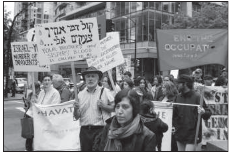
Within hours of the Israeli attack, protesters hit the streets in Vancouver on May 31.