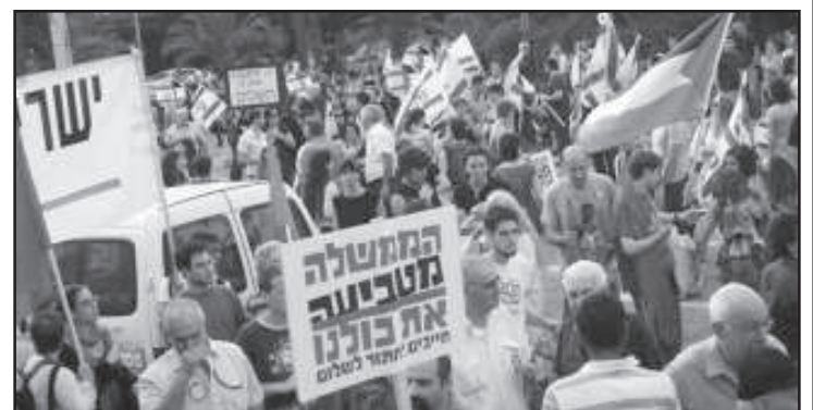
Photos from the June 5 rally in Tel Aviv show the welcome unity of Jewish and Arab peace activists inside Israel.

(Report from Communist Party of Israel, www.maki.org.il/ )