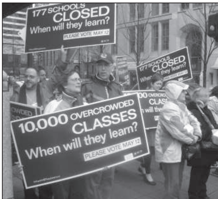
BC Teachers Federation delegates rally against education funding cuts during their 2009 Convention.