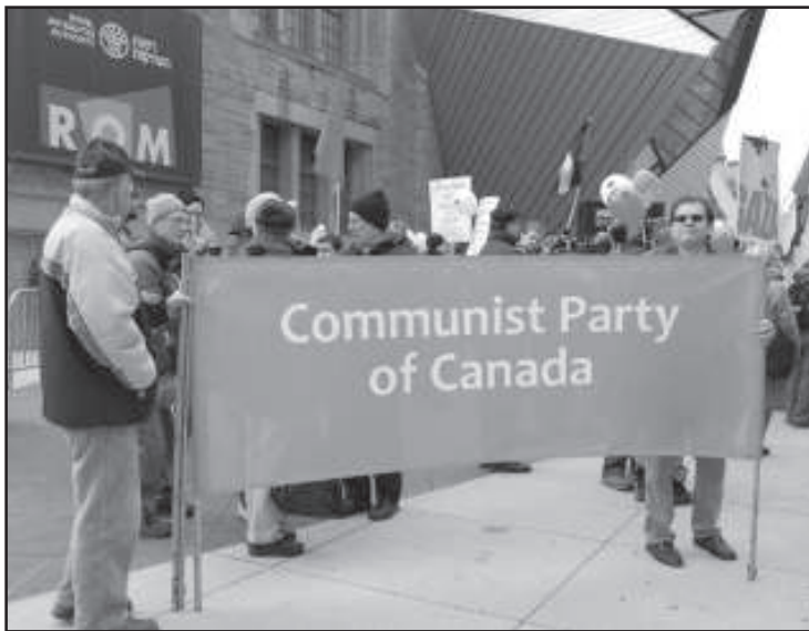
Communist Party banner at rally against Israeli aggression.

The overwhelming reaction by Canadians is to call the Israeli attack on the Freedom Flotilla an act of war. Yet the Harper federal government, which was hosting Israeli PM Benjamin Netanyahu when this attack took place, has responded by calling for "investigations" to allow the state of Israel to buy time to evade international criticism. The position of the Harper government is utterly unacceptable. We join with others in demanding that