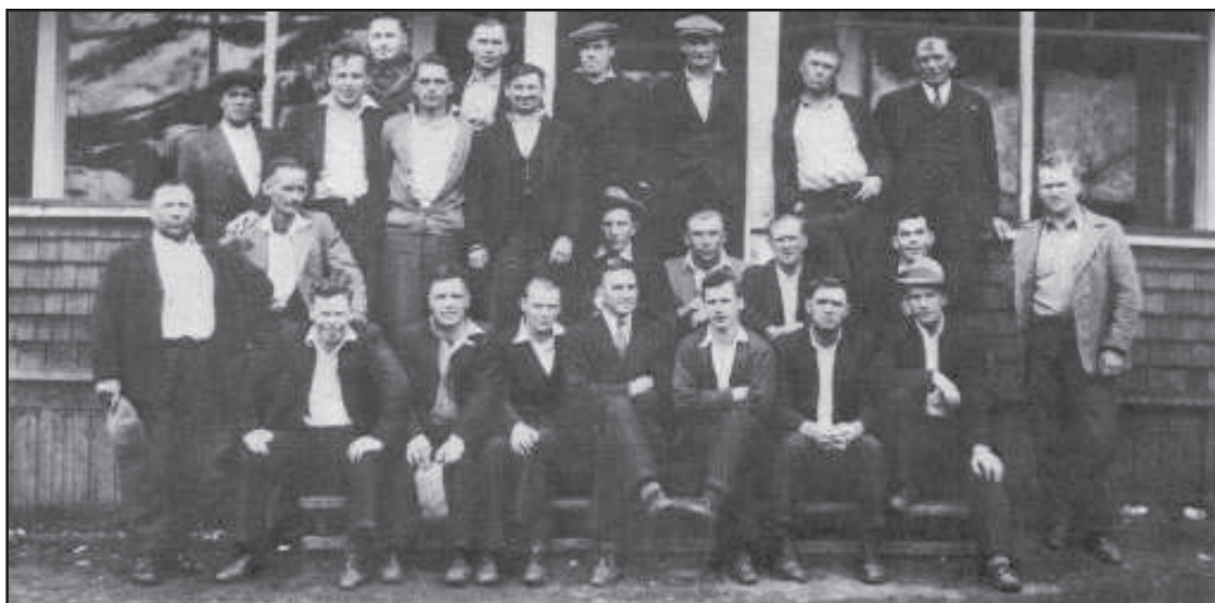
The leaders of the Corbin strike, including the 17 who were arrested and held for three days.

Much of the information in this article is found in the book "Fighting Heritage," Tribune Publishing Co., 1985