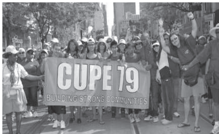
CUPE 79 members at Toronto's Labour Day Parade last year.

However, from the onset of the Convention, the CUPE Ontario budget defined much of the debate. In her first report, Rennick revealed