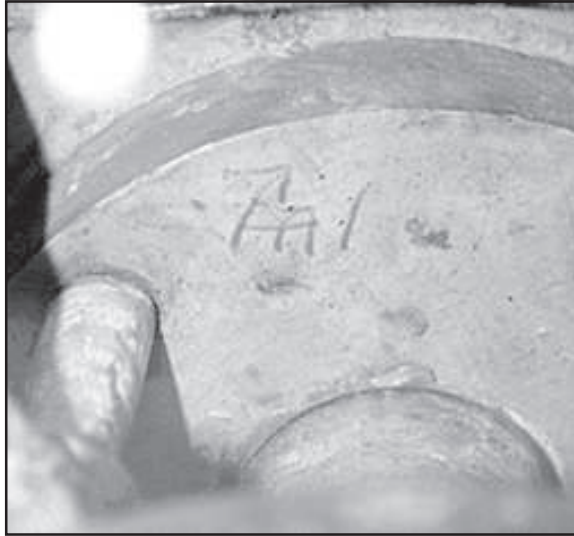
Investigators claim that this marking on a salvaged chunk of torpedo debris, which means "No. 1" in Korean, is consistent with markings found on another North Korean torpedo. They have not explained how this marking survived the explosion which destroyed the Cheonan .

Lee Myung-bak made his position clear late in May by ignoring the offer and stating unequivocally that North Korea deliberately attacked the South.