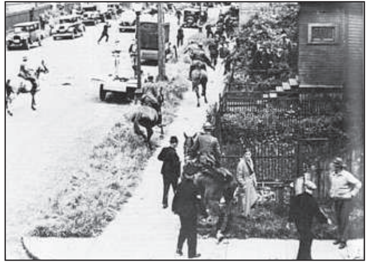
Cops on horseback roamed the streets attacking people during the "Battle of Ballantyne Pier"

As with the Relief Camp Workers and the Mine Workers Union, there were Communist Party members and other left-wingers among the leadership and rank and file of the waterfront strikers. During this period, company-dominated unions "represented" workers at ports along the west coast. The key shift took place in San Francisco in 1934, when radical labour leader Harry Bridges led a successful struggle which