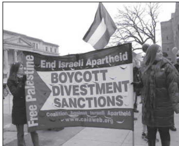
January 2009: During Israel's illegal invasion of Gaza, Toronto demonstrators rally to support boycott campaign.