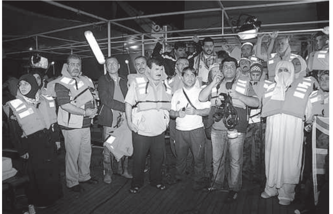
Some of the crew and passengers on the Mavi Marmara , before Israeli commandos attacked.

head, twice in the leg and once in the back from a distance of less than 45 centimetres," reports Press TV.