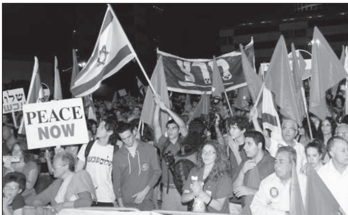
Scene from the rally of 15,000 anti-war protesters held June 5 in Tel Aviv.